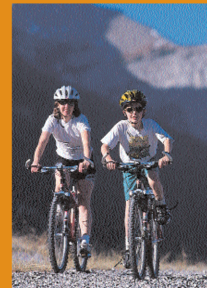
Site of the 1988 Olympic Winter Games Nordic Ski Events